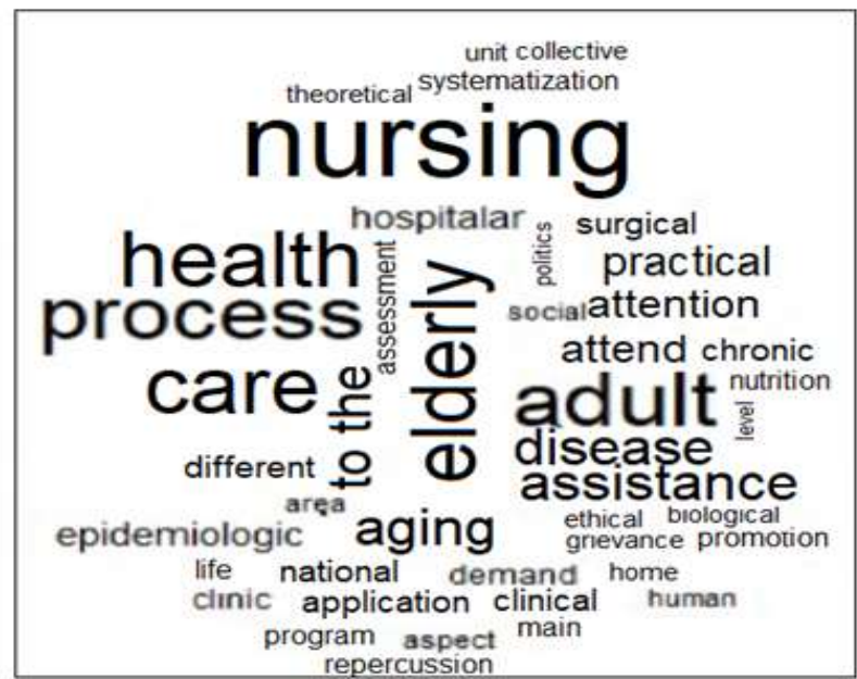
Figure 1. Word cloud: care for the elderly in undergraduate nursing courses in Paraná.